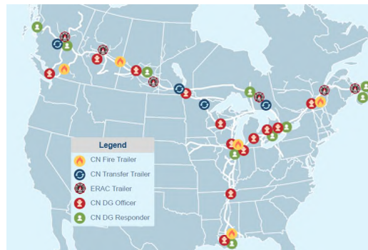
CN Emergency Response Resources— Protecting the Communities Along Our Network

CN also has response equipment strategically located across the network to respond to a rail incident. For more information, go to: www.cn.ca/dg